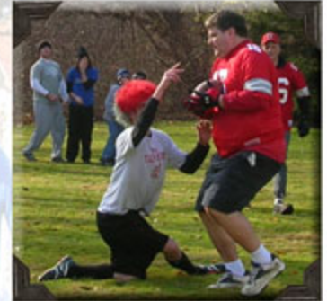
Was this an interception?