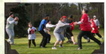
The game is won in the trenches.