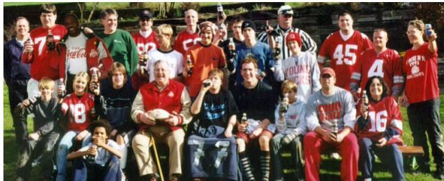
Turkey Bowl XXII Participants with Archie Griffin