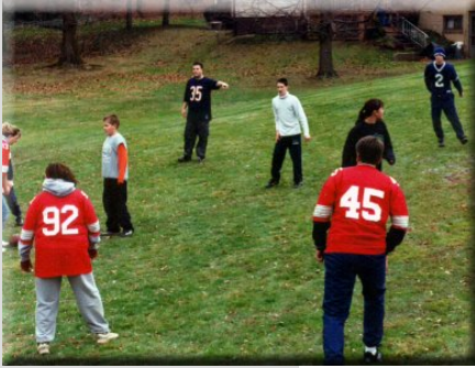
The Young Bucks set their defense.

"Tradition, I don't know about that, I just show up and spank whoever lines up on the other side."