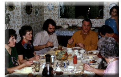
The grown up table

[I remember] mostly just kids in the back TV room talking and being just regular kid goofy. Bruce Nicolls