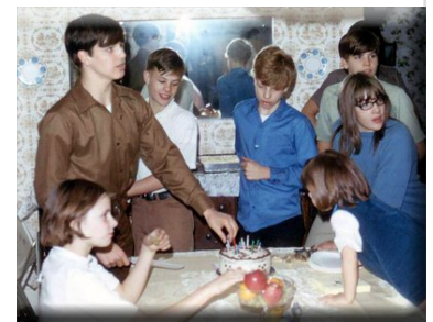
How did we all fit?