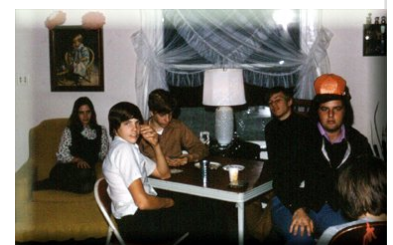
The kids tables