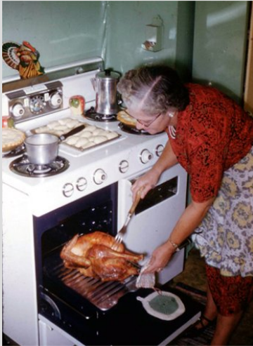
Grandma with her new oven bought by her children

Thursday – November 29, 1917 – 11:30 A.M.