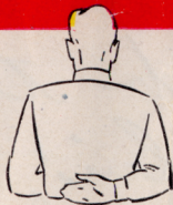
Illegal forward pass