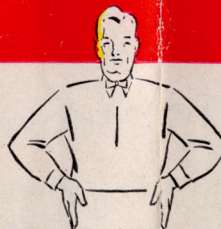
Off-side or violation of free-kick rules