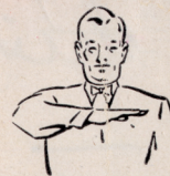
Illegal motion or formation at snap