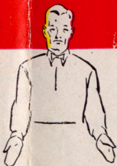
Crawling, pushing or helping runner